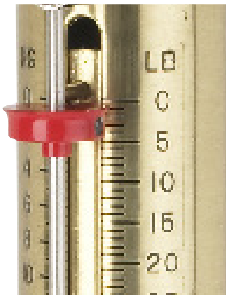
Maximum Reading Pointer